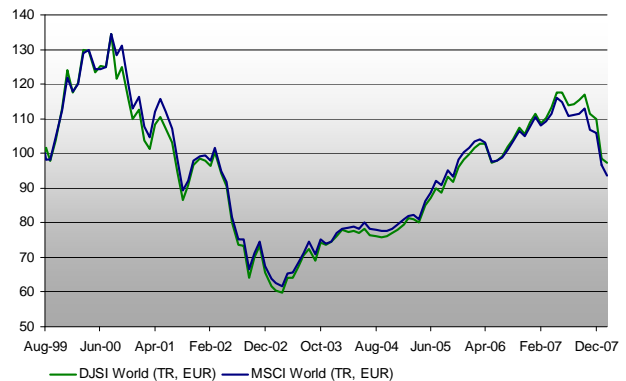
Chart since Launch